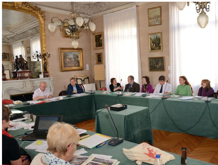
Meeting of the Board of Directors – March 2014 in Fontainebleau